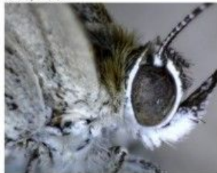
Butterfly with EDOF