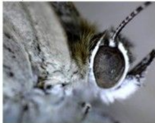
Butterfly without EDOF